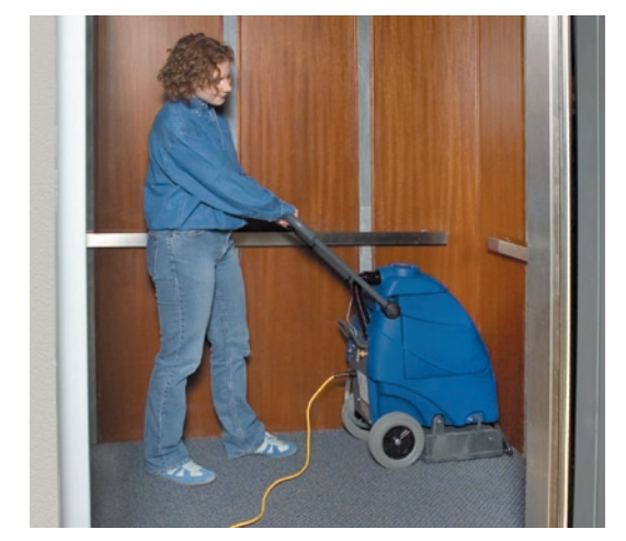
The Clarke® Clean Track™ 12 carpet extractor gives you big cleaning capacity for those small areas.