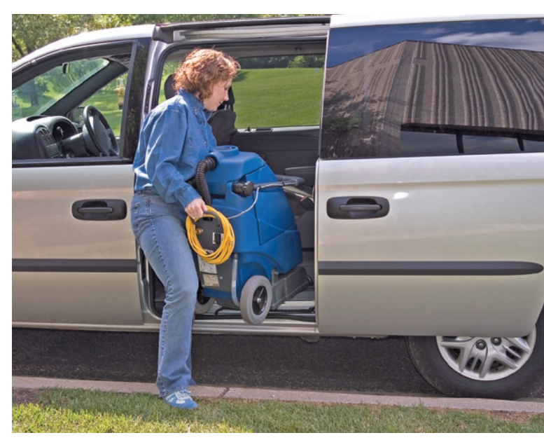
Hand grips and compact folding simplify easy lifting and transport.