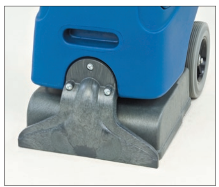
The vacuum shoe is designed with laminar flow technology allowing more moisture recovery, resulting in fast drying times.