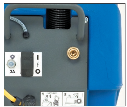
Universal symbols on the control panel simplify easy operation.