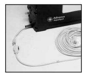
Power cord detaches so operator doesn't have to wind and carry it when emptying/ refilling the tanks.