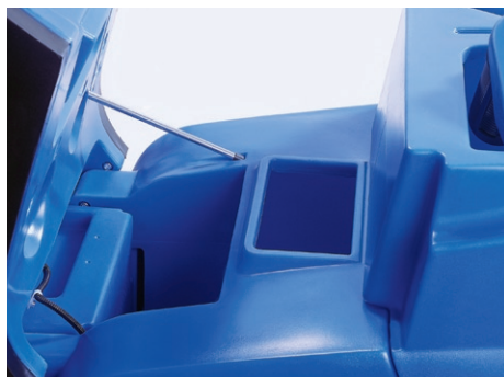
The solution tank opening is located directly under the flip-style seat. The recovery tank is up top and is easily drained by a hose located on the back of the machine.