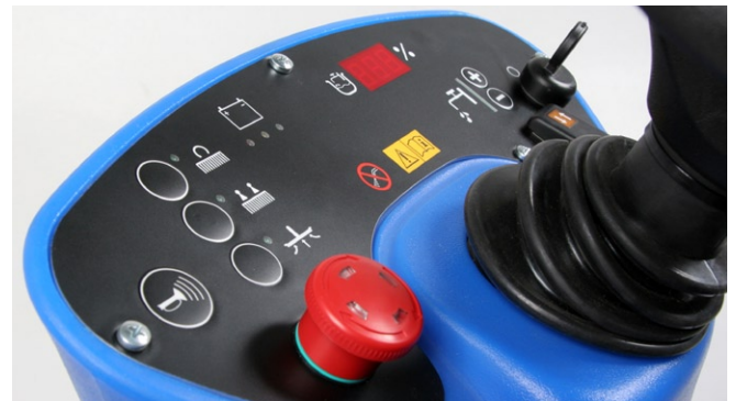
Universal One-Touch™ controls and digital solution level indicator makes the CR28 BOOST® Rider easy to operate.