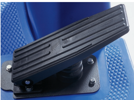
Variable speed non-skid pedal controls operator speed for precise cleaning.