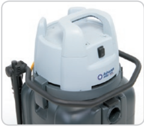
Adjustable handle folds over the machine for easy transport.