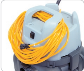
Convenient cord storage over motor top handle.