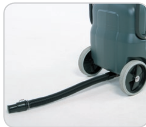
Rear drain hose makes emptying a breeze.