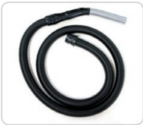
50 foot cord and 10 foot hose for long cleaning reach.