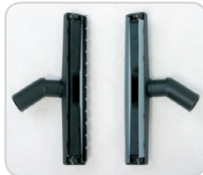
14 inch hard floor and squeegee tools.