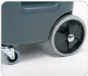
Gray non-marking wheels.